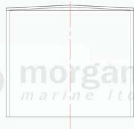
EXTERNAL ELEVATION WALL 4