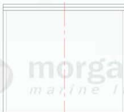
EXTERNAL ELEVATION WALL 1